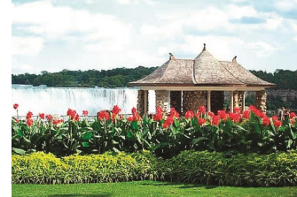
Visit beautiful Queen Victoria Park