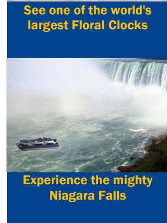
Experience the mighty Niagara Falls