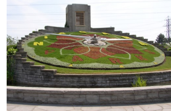
See one of the world's largest Floral Clocks